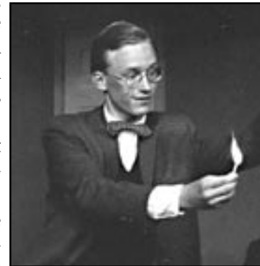
As "Zeppo Marx in Minnie's Boys , 1998.