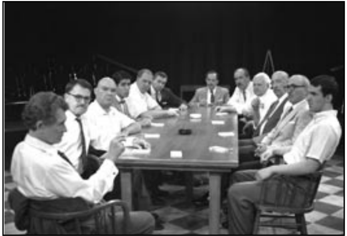
Jurors gather in the deliberation room in a scene from Twelve Angry Men , the ultimate trial drama, now on stage through April 18 at Good Company Players' 2nd Space Theatre.

Tickets for Twelve Angry Men and The 25th Annual Putnam County Spelling Bee are now on sale at the Box Office or by phoning 266-0660 or 800-371-4747.